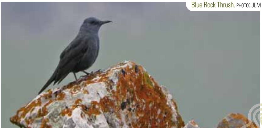
Blue Rock Thrush.

In spring you can mainly hear Blackcap's song which then is replaced by a deep loud clicking sound in winter.