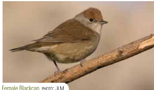
Female Blackcap.

end at an area of low mountains and where you can find the Spectacled Warbler during breeding season. Along the last stretch of the walk downhill is lined with unusually thick trunks of olive trees and where the Rufous-tailed Scrub Robin occurs repeatedly and can be seen in spring and summer, however in very low numbers. Local inhabitants are familiar with this scarce bird and recognise its progressive disappearance in recent years.