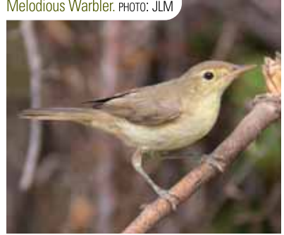
Melodious Warbler.

This stage is especially recommended in spring, a time when some interesting summer visitors start nesting; also in winter time when the abundance of birds is quite remarkable. ○