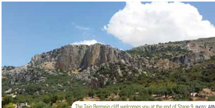
The Tajo Bermejo cliff welcomes you at the end of Stage 9.

these olive trees have been yielding fruit for over a hundred years (some of the olive tree trunks you will be passing by deserve a moment of your attention). In the vicinity of Cortijo de Marchamona and along the last section of Stage 9 you will be getting close to the impressive rock faces which give shelter to some fascinating rock-dwelling species.