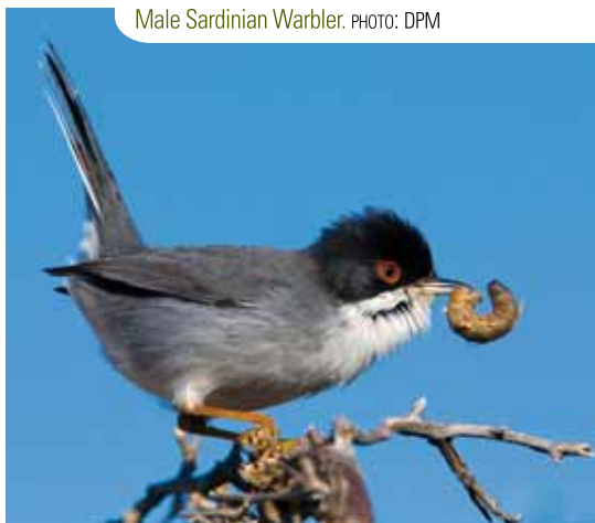
Male Sardinian Warbler.

Before entering an area populated by pine trees you will be passing by a low mountain range with gorse, dispersed full-sized holm oak trees and some bare rock formations. In this patch the typical rock-dwelling species start to occur and woodland birds are becoming more frequent, especially Blue Rock Thrush and Black Wheatear, joined in winter by Black Redstart in the rocky sections.