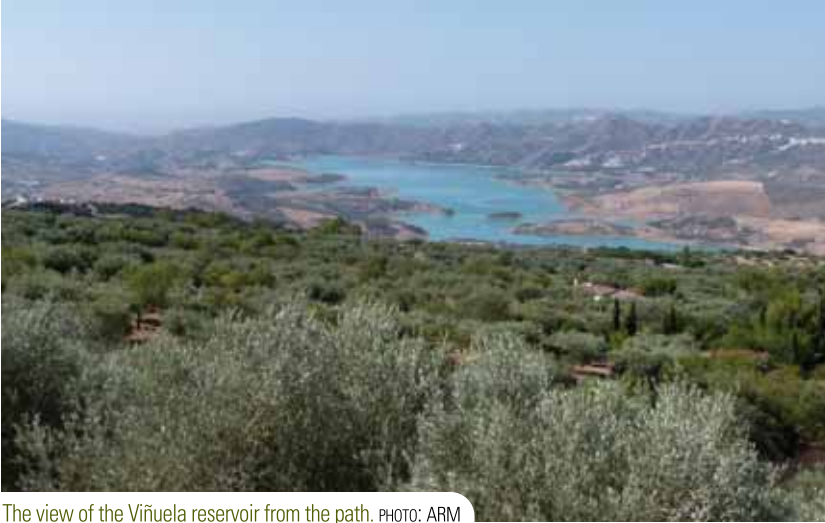
The view of the Viñuela reservoir from the path.

Additionally to Blackcaps you can see Eurasian Sparrowhawk, European Turtle Dove, Common Wood Pigeon, Common Blackbird, Song and Mistle Thrush, Golden Oriole and you have a chance to hear Scops Owl, Barn Owl and Red-necked Nightjar at night. Once you leave the cortijo behind, you will be passing through a quite closed-in thicket of wild olive, where, on top of the passerines you have seen so far, the Eurasian Jay is present and it announces your arrival with its alarm calls. Especially in winter this area is populated by birds coming from central and northern Europe which find food and shelter in the wild olives which let them survive the cold months (these mainly include Song Thrushes, European Robins and Blackcaps.