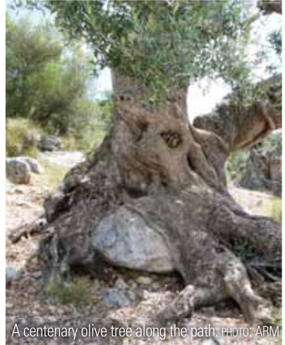
A centenary olive tree along the path.

Woodchat Shrike show up; Common Linnet can be added here to the previously mentioned list of finches. In addition, you can see partridges, Little Owl and birds of prey such as Short-toed Eagle and Common Kestrel. In the stretch covered by pine trees you will be able to see European Turtle Dove, the Great Tit again, together with Blue Tit and Common Chaffinch. From the very first flat area at the beginning of this stage of the walk large Aleppo pines are present, which, together with grain fields allow for a greater wealth of species you will be able to watch: Common Wood Pigeon, Thekla Lark, Melodious Warbler and in the distance, flying over the rock faces towering over Cortijo de Marchamona, Red-billed Choughs. From this stretch up to Guaro you will find grain fields and olive groves with frequently occurring partridges, Hoopoe, Barn and Red-rumped Swallows, larks, Meadow