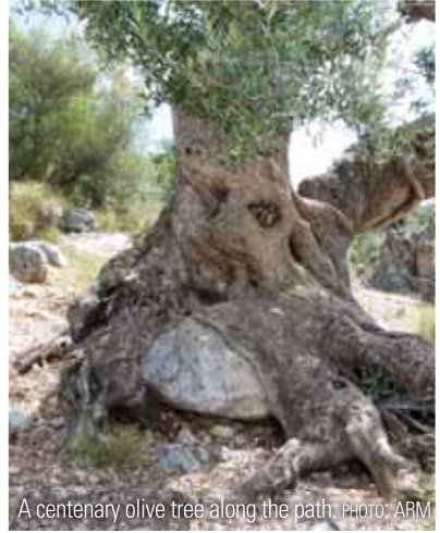
A centenary olive tree along the path.

Woodchat Shrike show up; Common Linnet can be added here to the previously mentioned list of finches. In addition, you can see partridges, Little Owl and birds of prey such as Short-toed Eagle and Common Kestrel. In the stretch covered by pine trees you will be able to see European Turtle Dove, the Great Tit again, together with Blue Tit and Common Chaffinch. From the very first flat area at the beginning of this stage of the walk large Aleppo pines are present, which, together with grain fields allow for a greater wealth of species you will be able to watch: Common Wood Pigeon, Thekla Lark, Melodious Warbler and in the distance, flying over the rock faces towering over Cortijo de Marchamona, Red-billed Choughs. From this stretch up to Guaro you will find grain fields and olive groves with frequently occurring partridges, Hoopoe, Barn and Red-rumped Swallows, larks, Meadow