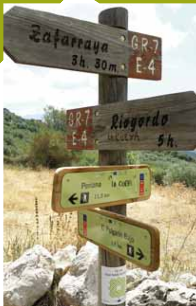
An intersection of footpaths on the way.

LAs you leave Periana there are abandoned olive and almond tree groves with a few saplings of young holm oaks which show the potential of the terrain to become woodland. From the beginning you will find species characteristic to open areas together with the typical forest-dwellers, though the latter are small in numbers.