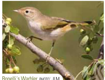
Bonelli's Warbler.