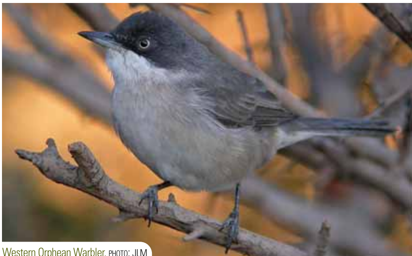
Western Orphean Warbler.

Portuguese gall oaks. Once you are in the rocky environment approaching the highest parts of the walk, you may be able to see Golden Eagle, Bonelli's Eagle, Alpine Swift, as well as Crag Martin, Blue Rock Thrush, Black Wheatear, Western Jackdaw, Red-billed Chough, Raven and Rock Sparrow. Even though Griffon Vulture does not nest in these mountains, it can be seen relatively often in small groups.