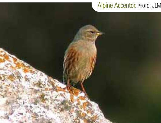
Alpine Accentor.

The star species of the highest parts of Stage 11, which can be seen during spring and summer months, is the Common Rock Thrush, a bird belonging to the Thrush family whose males present exceptionally striking plumage. Also in these higher parts of Stage 11 you will be able to find Northern Wheatear and Alpine Accentor. Once in the area of Hondoneros, along the downhill section approaching the end of Stage 11, the previously mentioned species are joined by the Eurasian Woodcock and Common Whitethroat in the shady spots, then Redwing, Ring Ouzel, Subalpine Warbler, Bonelli's Warbler, and, occasionally, Brambling. This is also a good site to watch the majestic flight of the Golden Eagle and listen to the Eagle Owl. As you get closer to the village, and your destination, crop fields start appearing more often, where the most common birds are the Eurasian Collared Dove, Spotless and Common Starling and finches.