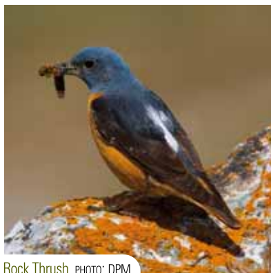
Rock Thrush.

You can also find White Wagtail, Grey Wagtail, Nightingale and Cetti's Warbler around the stream Arroyo de Los Cerezos.