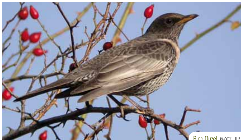
Ring Ouzel.

Common Linnet, Serin and Greenfinch, however once you are on the uphill section leading to the copses of holm oak, species typical of scrub start occurring such as Red-legged Partridge, Common Stonechat, Common Blackbird, European Robin, Black-eared Wheatear, Sardinian Warbler, Black-eared Wheatear, Dartford Warbler, Woodchat Shrike, and forest birds such as Song Thrush, Great Tit, Common Chaffinch and Rock Bunting. Birds in flight include the almost constantly present Common and Pallid Swifts together with Hirundines (mainly Barn and Red-rumped Swallow and House Martin) during the months when these species are present here. In the tree formations composed mainly of pines, then holm oaks and Portuguese gall oaks further on, the Eurasian Sparrowhawk might make an appearance, as well as European Turtle Dove, Common Wood Pigeon, Cuckoo, Scops Owl, Tawny Owl, Hoopoe, Great Spotted Woodpecker, Green Woodpecker, Woodlark, Wren, Song and Mistle Thrush,