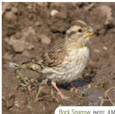
Rock Sparrow.