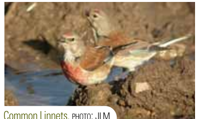
Common Linnets.

however given the type of habitat it lives in, the animal must be vulnerable to water contamination and the degradation of riparian vegetation. ○