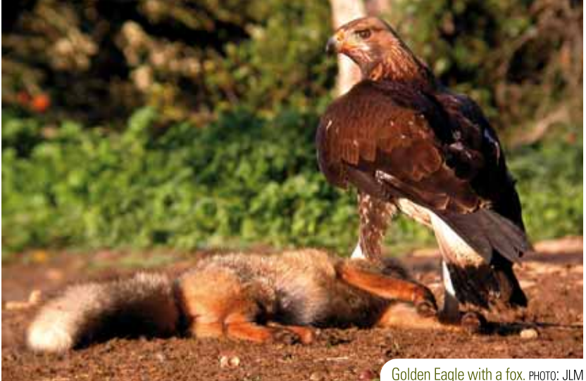
Golden Eagle with a fox.