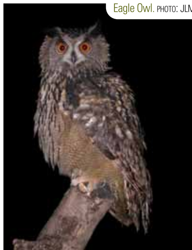
Eagle Owl.

Blackcap, Firecrest, Coal Tit, Blue Tit, Short-toed Treecreeper, Eurasian Jay, Crossbill, Hawfinch, Cirl Bunting and at times during some winter seasons, Yellowhammer. In the copses of holm oak you have a chance to see the Western Orphean Warbler and Azure-winged Magpie, and Iberian Chiffchaff in the more humid areas with