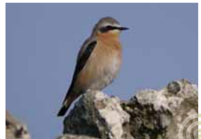
Northern Wheatear.