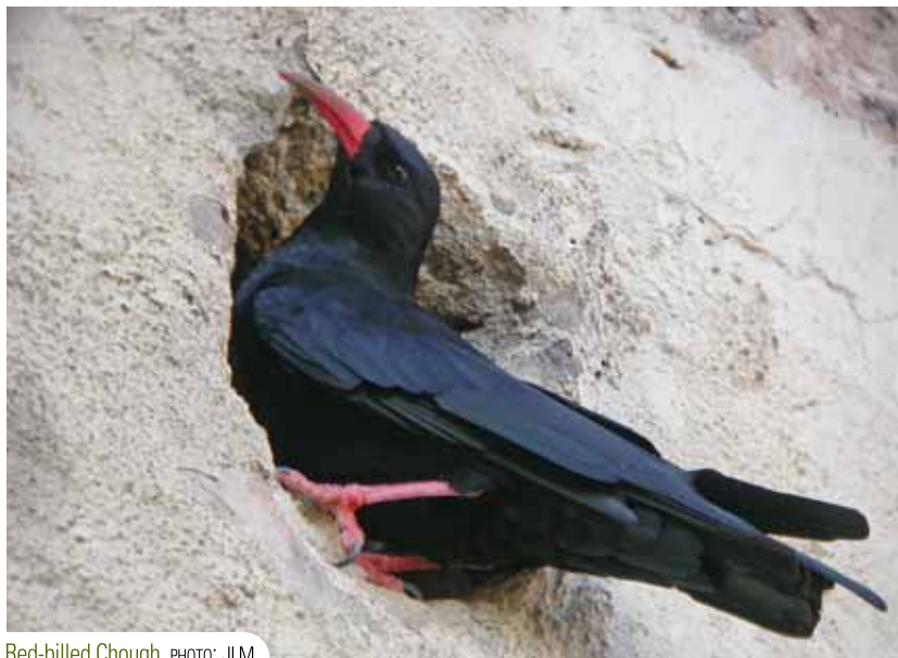
Red-billed Cough.

From here to Benaoján, cultivated areas intertwine with natural vegetation along the last section which leads to the end of Stage 24, the Benaoján Station.