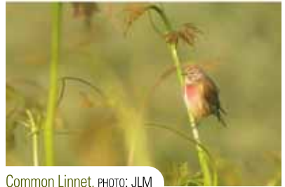
Common Linnet.

Its flying abilities make it possible for the bird to cover hundreds of kilometres a day in search for food. The prestigious science magazine "Nature" declared that these birds spend first two years of their lives in the air, without perching, and even sleep on the wing.