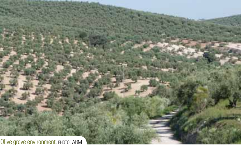
Olive grove environment.