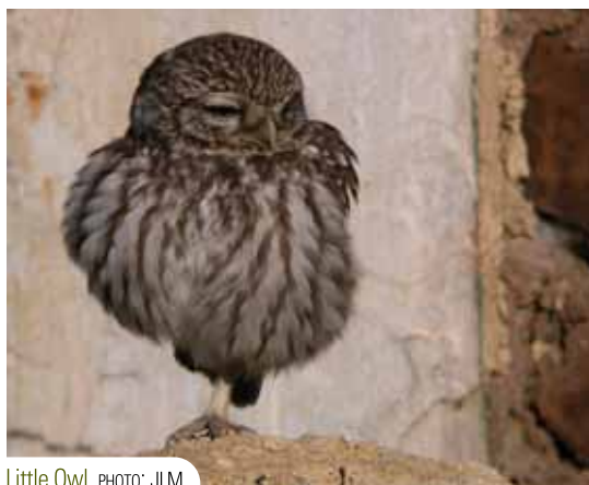
Little Owl.

The track which you pass by on your left in Barranco Hondo climbs along the valley and joins the MA-206 road, where