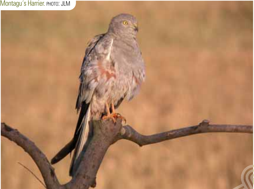
Montagu's Harrier.