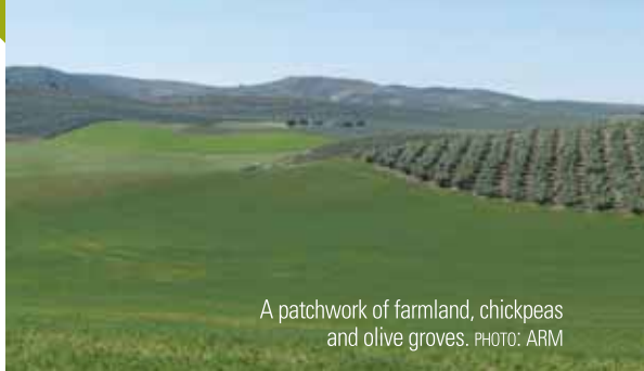
A patchwork of farmland, chickpeas and olive groves.

The first steps of Stage 16 take you along the stream Arroyo de Barranco Hondo and very soon the path enters an olive grove again, which will keep you company, alternating with a patchwork of dry crop