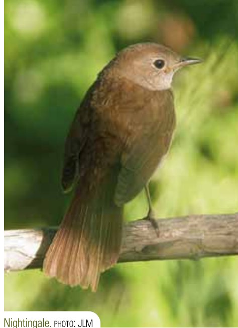
Nightingale.

You can also see large raptors such as Short-toed, Bonelli's, Booted and Golden Eagle, drawn by the presence of prey, as well as Common Buzzard and Common Kestrel; in spring and summer you can find Montagu's Harrier, a species which breeds in the surroundings of the path. Once you reach Barranco Hondo, you will walk past, on your left, a patch of dry farming land (mostly cereal or chickpeas, depending on the time of the year) which represents a steppe environment in the province; here you can see the Montagu's Harrier, Lesser, Kestrel, Stone-curlew, Little Bustard, Skylark and Calandra Lark. Other species occurring in the area are Common Kestrel, Barn Owl, Little Owl, Eagle Owl, Red-legged Partridge,