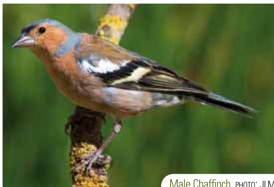
Male Chaffinch.

identifying Swallows, as in spring and summer it is possible to find up to 4 species at the same time (Barn Swallow, Red-rumped Swallow, Crag and House Martin) Additionally to the previously mentioned species of birds, the type of vegetation encourages the presence of Blackcap and Black-eared Wheatear. It is worth mentioning the presence of olive trees with very thick trunks before you arrive at Periana where amongst the Great Tits and Chaffinches you may be able to spot the rare Rufous-tailed Scrub Robin, however it is a bird which is difficult to see.