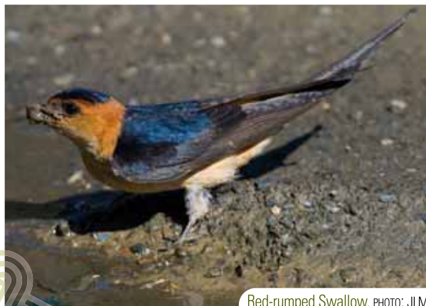
Red-rumped Swallow.

Before arriving at Alcaucín you will be passing through uncultivated areas and vineyards where Crested Lark occurs, with the typical crest on its head and its cheerful song. Also, there is the Common Stonechat, Sardinian Warbler, Goldfinch, Common Linnet, Greenfinch and Serin. From Alcaucín onwards you will start walking downhill towards cultivated land, mainly olive