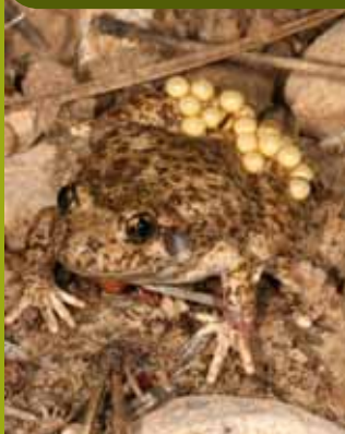
Iberian Midwife Toad ( Alytes dickhilleni )