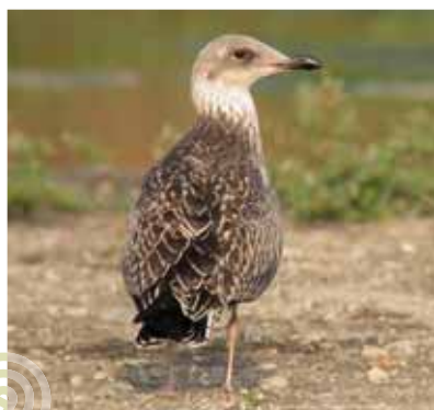
Yellow-legged Gull.

riods you can also find Slender-billed and Little Gull. Winter storms can bring, with a bit of luck, the Black-legged Kittiwake. Occasionally, also in winter, there are some individuals of the Great Black-backed Gull, a giant among Spanish gulls. Using a telescope and spending some time, you may see a few individuals of the Great Skua and the Arctic Skua in flight, chasing gulls. The alcidæ family is represented by the Razor-bill in winter, either in small groups or single individuals, and using a telescope you may be able to see Puffins. It is a known fact that there are wintering Common Guillemots (Guillemots) along the coast as sometimes beached individuals turn up after great storms. The alcidæ family is linked to gulls and waders (Order Charadriiformes), which are seem similar to penguins and which occupy a similar trophic niche as penguins but their taxonomy is not related.