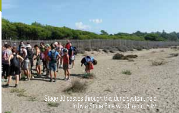
Stage 30 passes through this dune system, held in by a Stone Pine wood.

Stage 30 begins at the beach promenade, Paseo Marítimo de Estepona, at the eastern tip of the Playa de la Cala beach. During this stage you will be walking past the sea on your right and crossing the many short rivers of the western Costa del Sol. After 27, 1 km you will arrive at Paseo Marítimo de Marbella, where Stage 30 ends at the mouth of the stream called Arroyo Guadalpín, very close to the meeting hall building, Palacio de Congresos.