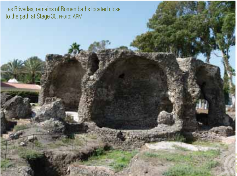
Las Bóvedas, remains of Roman baths located close to the path at Stage 30.

Common Scoter, Osprey, Oystercatcher, Black-winged Stilt, the three species of plovers (Common Ringed, Little Ringed and Kentish) Sanderling, Curlew, Whimbrel and Turnstone. Out of the mentioned birds, the Northern Gannet is especially noteworthy with its spectacular dives in search of fish; also Turnstone and Common Sandpipers which keep you