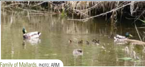
Family of Mallards.

especially that many urban areas contain pine tree formations which can sometimes compare with a wood, plus, there are also orchards and vegetable gardens. The most frequently seen species are Common Kestrel, Monk Parakeet, Wood Pigeon, Rock Dove, Turtle Dove, Turtle and Collared Dove, Barn Owl, Scops Owl, Little Owl, Red-necked Nightjar, Common and Pallid Swifts, Hoopoe, Wryneck, Crested Lark, Barn and Red-rumped Swallow, Crag and House Martin, Meadow Pipit, White Wagtail, European Robin, Black Redstart, Stonechat, Common Blackbird, Blackcap, Sardinian Warbler, Common Chiffchaff, Firecrest, Spotted Flycatcher, Great Tit, Coal Tit, Crested Tit, Short-toed Treecreeper, Woodchat Shrike, Spotless and Common Starling, House