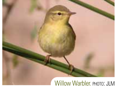
Willow Warbler.

You will be able to see terns, also closely related to gulls; the Sandwich Tern is noteworthy in winter, and it announces its presence with constant screeching. This tern's characteristic feature is a black beak with a yellow tip. It is worth paying attention to this "chap" during migration periods as there is a possibility it might turn out to be a Lesser Crested Tern, also with black legs but with an orange beak. This bird is still considered a rarity but tends to be more and more frequent. Black and Whiskered Terns are also common on migration passages, as well as the Little Tern, which indeed is the smallest of the family. Other species associated with the coastline are Black-necked Grebe, Cory's and Balearic Shearwater, Northern Gannet, Great Cormorant,