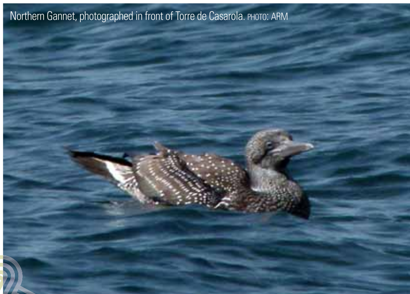
Northern Gannet, photographed in front of Torre de Casarola.

Finally, urban birds present in the town centres along the stage are worth a mention; their list is quite extensive,