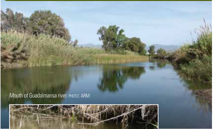
Mouth of Guadalmanza river.