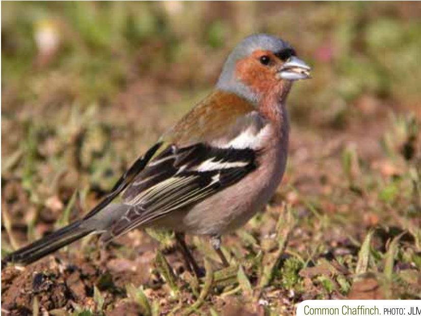
Common Chaffinch.

At the starting point typical urban dwellers are present (basically Eurasian Collared Dove, House Sparrow, Spotless Starling and Black Redstart in winter), however the landscaped area around the Nerja cave attracts a high diversity of forest species typical of the woods which you will be passing through along Stage 5. This way, from the very beginning you can see Firecrest, Short-toed Treecreeper, Spotted Flycatcher, Great Tit, Coal and Crested Tit and Common Chaffinch. Along the stage the woodland birds are the most profuse ones, additionally to the above mentioned you can find European Turtle Dove, Common Blackbird, Common Chiffchaff, Eurasian Jay, Common