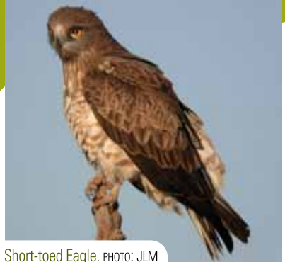
Short-toed Eagle.

From the very beginning of Stage 5, at the Nerja cave, you will have a chance to see typical forest-dwelling bird communities which become more abundant as you walk up into the pine woods. The impressive cliffs and summits of the Sierra Almijara will let you get familiar with mountain bird species and watch some of the large raptors. The areas of bare rock support species typical of that sort of environment and they are abundant enough to ensure sightings of