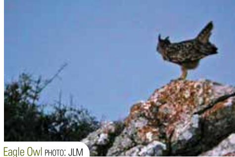
Eagle Owl

The mammals present in the area include the relatively easily spotted Spanish Ibex and other typical inhabitants of rocky environment such as Stone Martin which is much more difficult to see. Along Stage 5 you will have a chance to see many signs left by the fox on top of rocks and plants on the edge of the path. As far as vegetation is concerned you can encounter some interesting species including the African Maytenus senegalensis as well as Buxus baleárica and Cneorum tricocum .