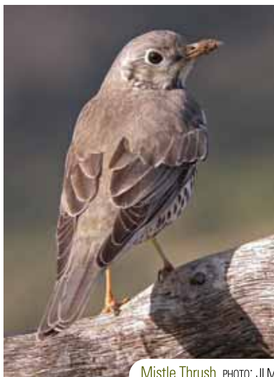
Mistle Thrush.

From this area until you pass through the settlement called Acedía, dotted with houses, and cork oaks mixed with scrubland constituting the main vegetation; again the already mentioned forest species occur, alongside those typical of open spaces: Spotted Woodpecker, Bee-eater, Hoopoe, Eurasian Jay, Blackcap, Great Tit and Chaffinch along with Crested Lark, Sardinian Warbler and Stonechat. Upon reaching the viewpoint of Peñas Blancas you can enjoy a broad view of Sierra Bermeja, and this is a good moment to scan the sky for raptors. Here you can see Griffon Vulture, Booted and Short-toed Eagle, Common Buzzard, Sparrowhawk, Common Kestrel, and with a little luck, Golden Eagle. During times of migration passage you can also observe Black Kite and Honey Buzzard. Next, you will come to Arroyo Vaquero and enter the sierra.