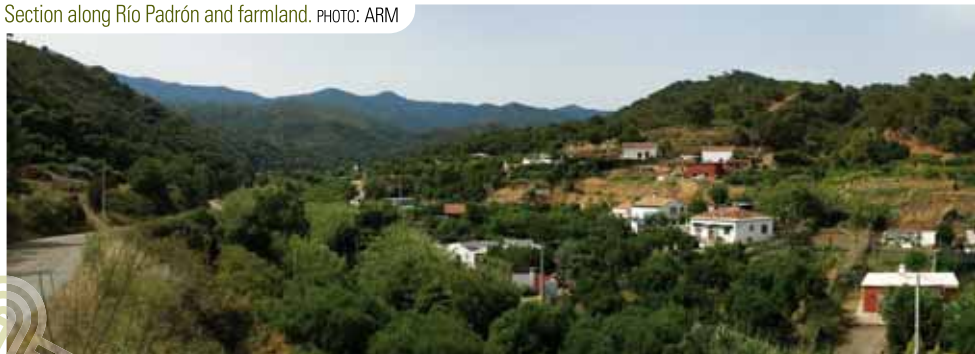
Section along Río Padrón and farmland.

of Lesser Kestrel and various pairs of Griffon Vulture in the rock faces visible from the viewpoints. Around the Arroyo de los Molinos you will be able to see river birds and species typical of cultivated areas. You will be walking along this characteristic environment of the Strait of Gibraltar region having flanked the southern corner of Sierra Bermeja. Here, the substrate changes to metamorphic rock. The great attraction of this stage