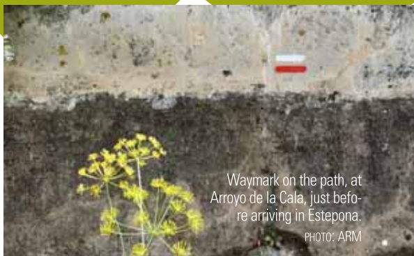
Waymark on the path, at Arroyo de la Cala, just before arriving in Estepona.

Stage 29 begins in Calle Carrera in Casares, at the birthplace of Blas Infante. You need to leave the village direction southwards, although the main direction of Stage 29 leads primarily eastwards. After 32.8 km of walking along the southern foothills of the Sierra Bermeja you will arrive in Estepona at Río de la Cala, and reach the promenade Paseo Marítimo.