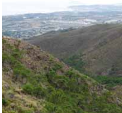
View of the coast from one of the streams.

of Lesser Kestrel and various pairs of Griffon Vulture in the rock faces visible from the viewpoints. Around the Arroyo de los Molinos you will be able to see river birds and species typical of cultivated areas. You will be walking along this characteristic environment of the Strait of Gibraltar region having flanked the southern corner of Sierra Bermeja. Here, the substrate changes to metamorphic rock. The great attraction of this stage