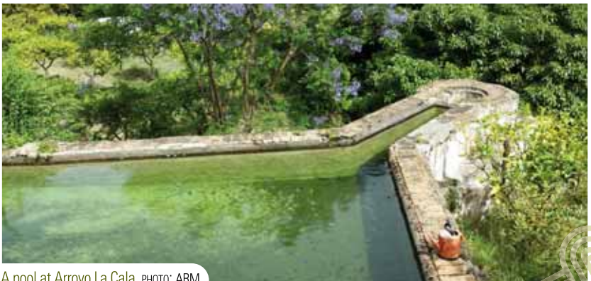
A pool at Arroyo La Cala.

The sierra Bermeja slopes are covered with loose rocks which can be hard on your ankles and you must tread carefully. The history of forest fires of the Sierra is clearly visible here, looking at the scarcity and dispersion of maritime pines. However, there is a single stand of pine before Barranco del Infierno. This area is dominated by larks, Stonechat, Black Redstart and Sardinian Warbler, together with finches, such as Goldfinch, Common Linnet and Greenfinch. You do need to keep looking at the sky as you may see some of the previously named raptors and gulls coming and going to the landfill. You could also spot the Black