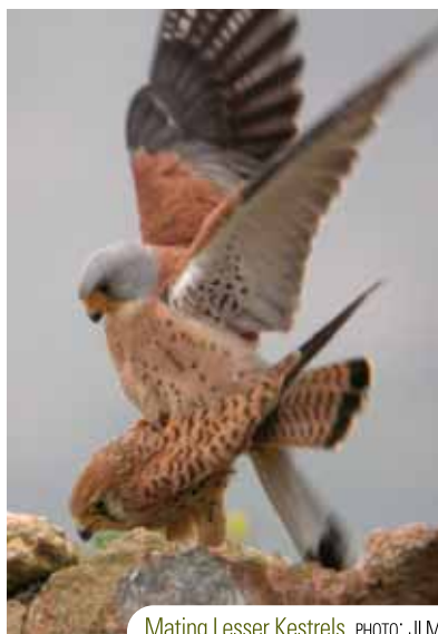
Mating Lesser Kestrels.

Peridotite is an ultramafic igneous rock of great hardness and high density which consists of ferromagnesian minerals and, when transformed, receives the generic name of serpentinite. The uniqueness of this particular substrate and its outstanding strategic location halfway between Europe and Africa are behind the great interest shown in Sierra Bermeja plants of serpentinite habitat, starting from the first work dedicated to the vegetation of this type of habitat published in the late sixties of the last century (Goday Rivas 1969). Botanically speaking, this area is considered a separate bio-geographical zone denominated Bermejense because of its special importance in Spain according to its level of speciation. Worth mentioning are the formations of Pinus pinaster var. acutisquama growing on peridotites, which are then replaced at a higher altitude by ultramafic Spanish Fir wood, the only one in the world (Asensi & Rivas Martinez 1976 Cabezudo et al. 1989).