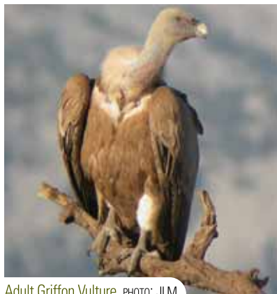
Adult Griffon Vulture.

on the season, can be highly diverse and abundant.