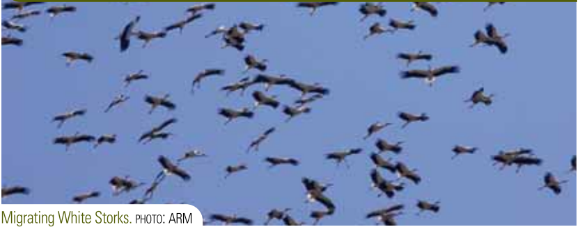
Migrating White Storks.

Following the stream along the slightly uphill section among pines and cork oaks, you can find European Turtle Dove, Wryneck, Robin, Blackbird, Mistle Thrush, Blackcap, Sardinian Warbler, Golden Oriole, Nuthatch, Short-toed Treecreeper, Greenfinch, Serin, Goldfinch and Common Linnet, plus Starlings and House Sparrows around the buildings. The climb leads to an esplanade where you will be able to see the section of mountains ahead and the town landfill, which sometimes attracts concentrations of thousands of birds. The majority are gulls (Yellow-legged, Lesser Black-backed and Black-headed), although there are also Cattle Egrets, Griffon Vultures and, during migration