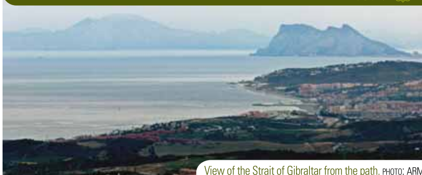
View of the Strait of Gibraltar from the path.

Stage 29 is not recommended for birding during the hottest month of the year. The location of the southern slopes of Sierra Bermeja within Stage 29 puts you in the mountains around midday and this is why hot months are best avoided.