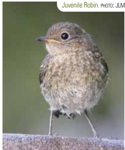
Juvenile Robin.