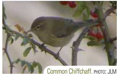
Common Chiffchaff.

Along Stage 28 you will note the presence of the reddish rocks of Sierra Bermeja.