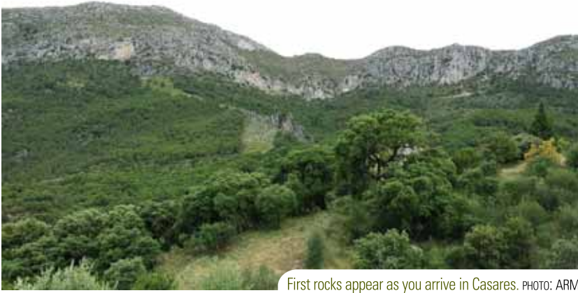
First rocks appear as you arrive in Casares.

since it is a superbly preserved cork oak wood, well maintained throughout the cork harvests.