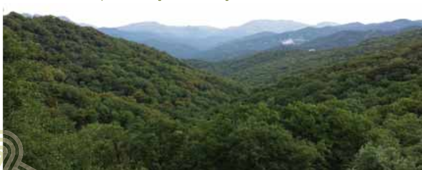
View from Monte del Duque with Genalguacil in the background.

of forest species named below. The Great Spotted Woodpecker is common in the area, as proved by the many holes found in the trees along the way. Also, the Green Woodpecker, Wood Pigeon, European Turtle Dove, Cuckoo, Wren, European Robin, Song Thrush, Mistle Thrush and Redwing, Common Blackbird, Blackcap, Sardinian Warblers, Bonelli's Warbler, Firecrest, Spotted Flycatcher, Coal Tit, as well as Blue Tit, Long-tailed Tit, Nuthatch, Short-toed Treecreeper, Eurasian Jay, Chaffinch, Goldfinch, Siskin, Greenfinch, Serin, Hawfinch and Cirl Bunting. Along the watercourses, especially the Almarchal river, such birds may turn