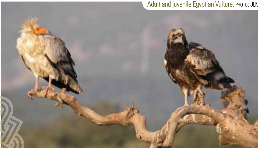
Adult and juvenile Egyptian Vulture.

The dragonflies found in the river Almarçal include Orange-spotted Emerald Oxygastra curtisii and Splendid