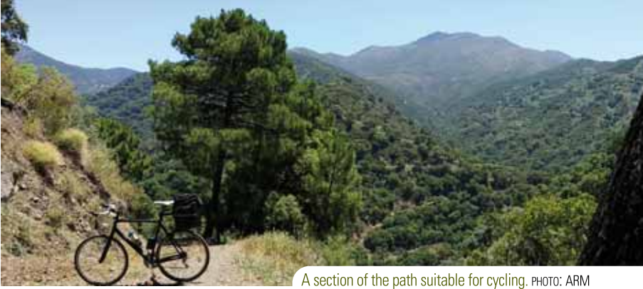
A section of the path suitable for cycling.

castle and its viewpoint are worth a visit, where you can see Lesser Kestrel during breeding season, and, occasionally, in winter. This is unusual as the species normally winters in the region of Senegal and Gambia. Besides the Lesser Kestrels you can enjoy close flybys of Griffon Vultures right over the village of Casares, as well as Booted Eagle and Common Buzzard in flight.