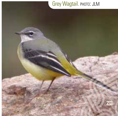
Grey Wagtail.