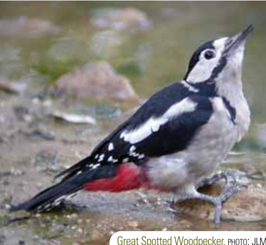
Great Spotted Woodpecker.

Cruiser Macromia splendens . These are special due to their rarity and precarious conservation status and both are considered endangered. Although the Otter is one of the most emblematic species of the stage as far as mammals are concerned, you may also find tracks of Fox, Genet, Badger, Weasel and Egyptian Mongoose. In addition, around Monte del Duque Red Deer could cross your path.