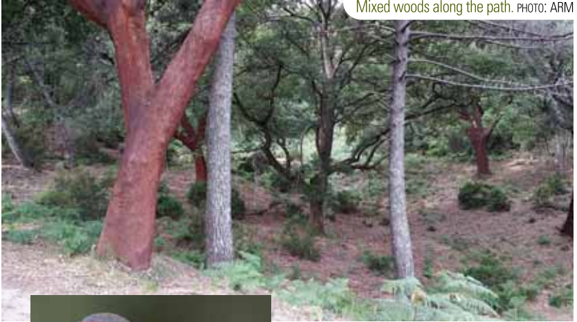
Mixed woods along the path.