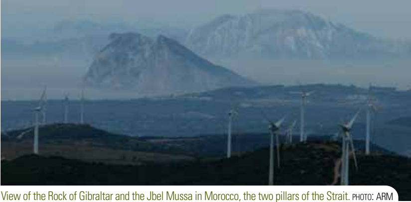
View of the Rock of Gibraltar and the Jbel Mussa in Morocco, the two pillars of the Strait.

These are the biggest outcrops of serpentinite in Spain and one of the largest in the world, which support numerous endemic species of flora and fauna associated with this globally rare ecosystem. The list of species recorded for Red Natura Sierra Bermeja includes a total of 20 endemic plant species, 17 species of unique invertebrates exclusive to this massif, and one endemic species of fish, described for science in 2006 (Doadrio & Carmona, 2006). The Squalius malacitanus chub is unique to the Genal, Guadalmina, Almárchal