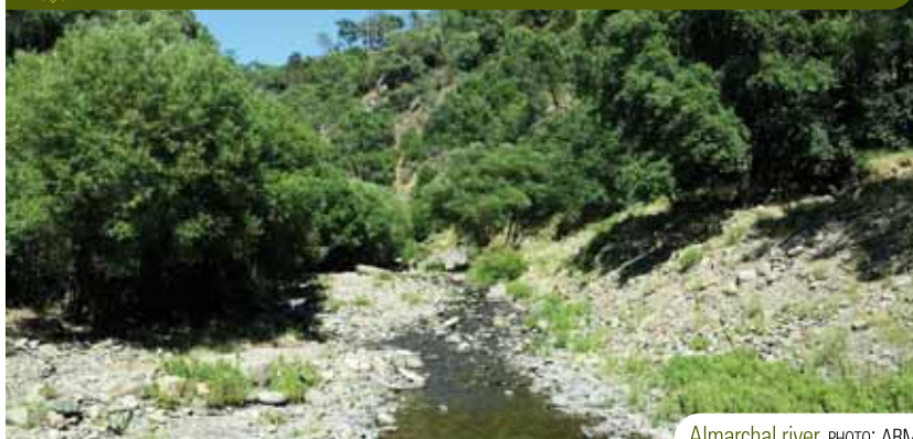
Almarchal river.

overhead. Genalguacil has a remarkable population of House Martins and Barn Swallows and, to a lesser extent, Red-rumped Swallows. Collared Dove, House Sparrow, Common and Spotless Starling are the predominant species in the village, although the diversity of birds which can be seen from the viewpoint (located at the starting point waymark) is very high, thanks to the privileged location of Genalguacil. Without having to leave the village you will be able to enjoy such birds in flight as Short-toed and Booted Eagle, Common Buzzard, Eurasian Sparrowhawk, Northern Goshawk and Common Kestrel, as well as a variety