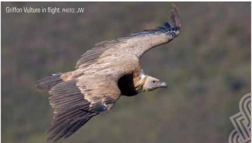
Griffon Vulture in flight.

Monte del Duque was first mentioned in written documents dated 1491, the same year when the Catholic Monarchs sold the village of Casares and all its land to the Duke of Cadiz, Don Rodrigo Ponce de León. From that moment the mountain has been recorded in writing as Monte del Duque (Duke's Mountain). It had been passed from hand to hand until the early twentieth century, when, already the property of the town hall and forming part of the confiscation of monastic properties ( desamortización de Madoz decree of 1855), the Monte del Duque was sold to Miguel Martínez de Pinillos y Saenz, grandson of the founder of the Naviera Pinillos. In August 1928, Martínez de Pinillos sold the estate to Federico García Rodríguez, (father of Federico García Lorca) and other partners, for a total of 1,250,000 pesetas. Federico owned 8% of the farm until his death in 1945. In the 1970s a court order determined the sole owner of the property to be the Capella family. In the 1980s current owner purchased the property. For more information visit the Spanish website www.iluana.com .